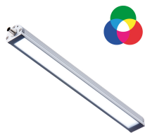
Darstellbares Farbspektrum / Displayable colour spectrum