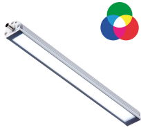
Darstellbares Farbspektrum / Displayable colour spectrum